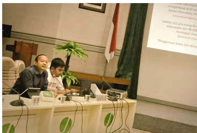
The LION team talking about asbestos victims during the meeting at the Jabar–Banten regional Social Security Office, Bandung

The following Monday LION had a meeting with officers of the West Java–Banten (Jabar–Banten) region Social Security (Jamsostek) department: head of regional operations and high-level personnel from the Bandung head office. The hearing went quite well, and we received a positive reception. The department agreed to accept claims of illness due to asbestos, provided the claimant was able to satisfy certain requirements, including the submission of results of a CT scan and diagnosis of an asbestos-related disease by an Indonesian doctor.