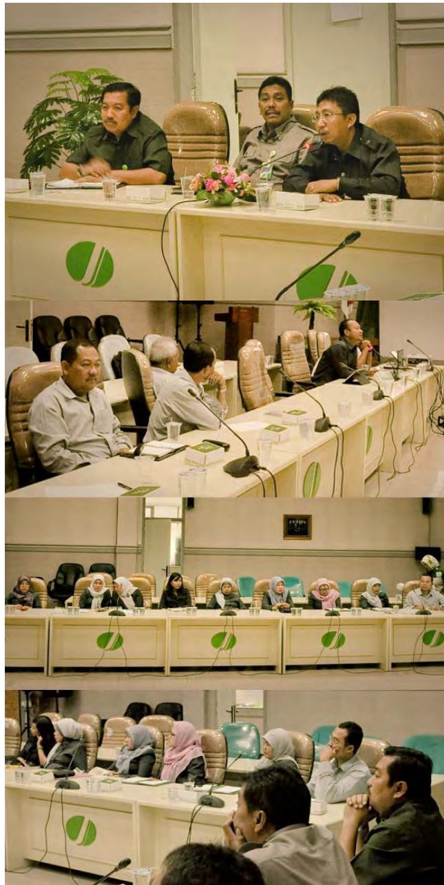
Participants at the meeting at the Jabar-Banten regional Social Security Office, Bandung

recommended that Branch office could involved LION in any training that will held later in all Jamsostek Branch on Jabar-Banten.