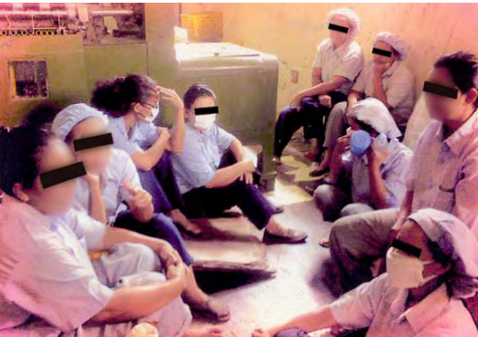
Conditions of factory and workers of PT Trigraha – Cibinong