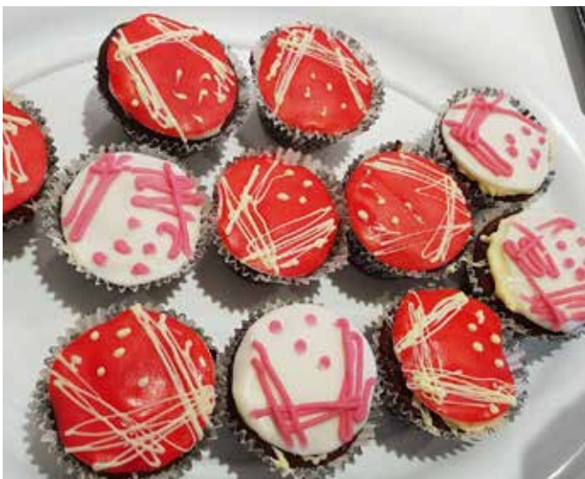
DANIKA HOPE'S PETRI DISH CUPCAKES