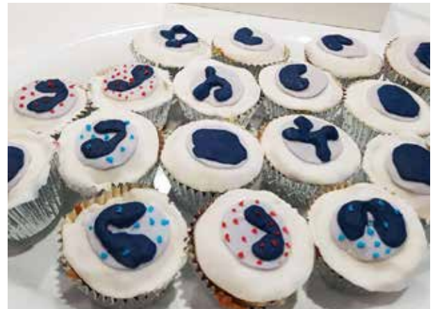
CAITLIN TILSED'S WHITE BLOOD CELL CUPCAKES, WITH EOSINOPHILS

Works of science, works of art, and thoroughly delicious!