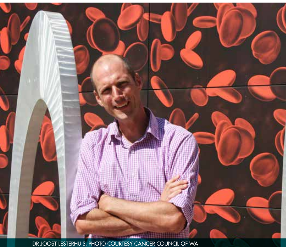
DR JOOST LESTERHUIS. PHOTO COURTESY CANCER COUNCIL OF WA