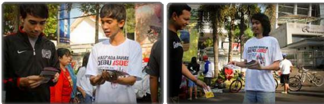
Our team members explaining the Asbestos Hazard to CFD visitors

The Car Free Day participants were quite enthusiastic about this campaign. They were very interested to learn about the asbestos hazard from the Ina Ban team. We handed out many brochures about the danger of asbestos; in only one hour we gave out 500 brochures from our total stock of 1000!