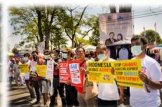
Our Protest in Gedung Sate