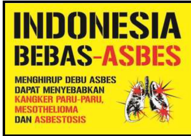
Poster 2 (see translation below)