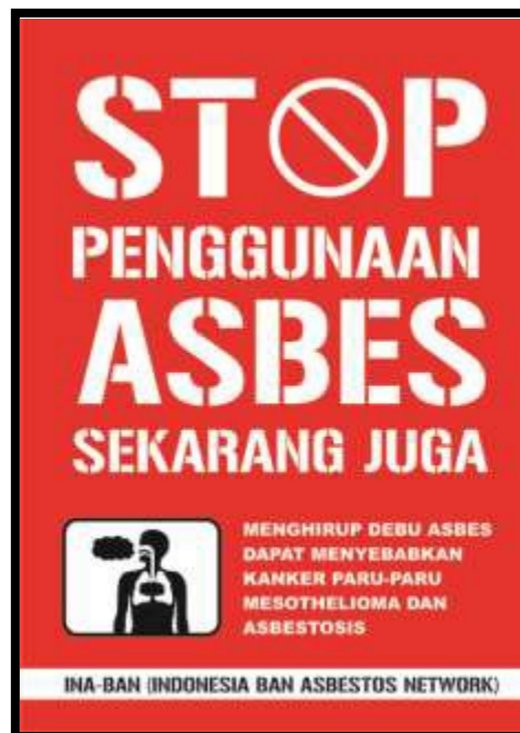
Poster 3 (see translation below)

Inhalation of Asbestos Dust can Cause Lung Cancer, Mesothelioma, and Asbestosis.