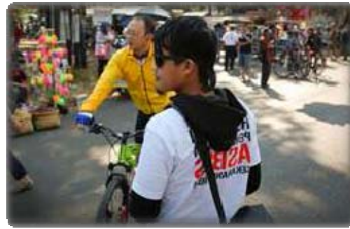
Car Free Day Dago Activities