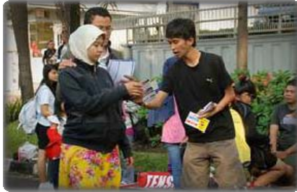
A Pregnant woman seriously listened to the explanation about the danger of Asbestos