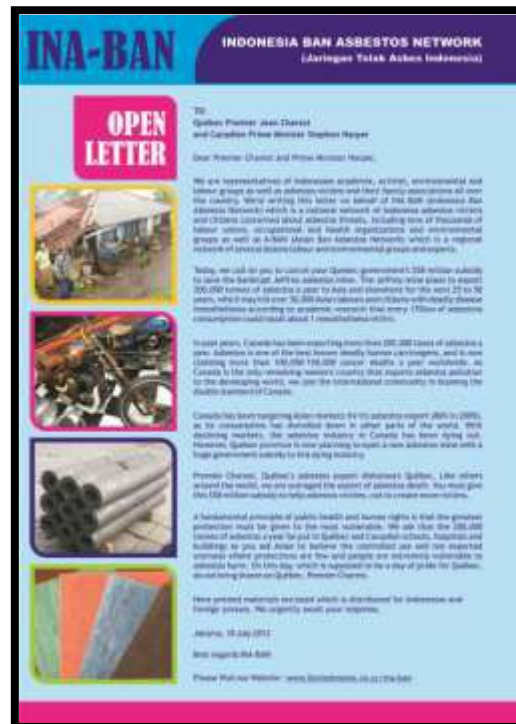
Letter to Canada Prime Minister in Poster Version